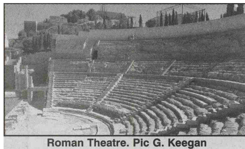
Roman Theatre.

If touring by car try to visit some of the following locations;